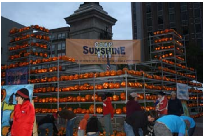
The Pumpkin Tower at the Portland Festival

One of the highlights of this event was the corporate carving challenge, where teams of up to 10 people from local businesses competed to see who could carve the most jack-o-lanterns within 10 minutes. Sadly, the 2008 Camp Sunshine champions were forced to hand over the title to the new champion, KG Partners, who carved an impressive 84 jack-o-lanterns in 10 minutes. Congratulations to the KG team!