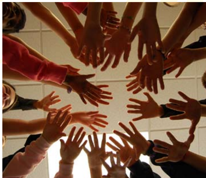
Hands from the 2009 Fanconi Anemia Session

As we continue to welcome families onto our campus and through our trademark three yellow doors, our hearts are filled, and we look forward to our next 25 years of dancing to Hands Up.