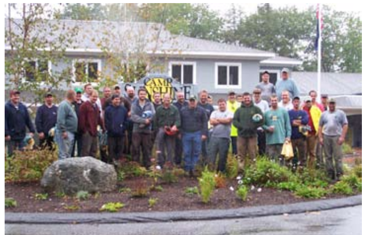
The Tree Guys Gather Together

We would like to extend a huge thank you to everyone who donated their time and equipment to help maintain the Camp Sunshine Campus!