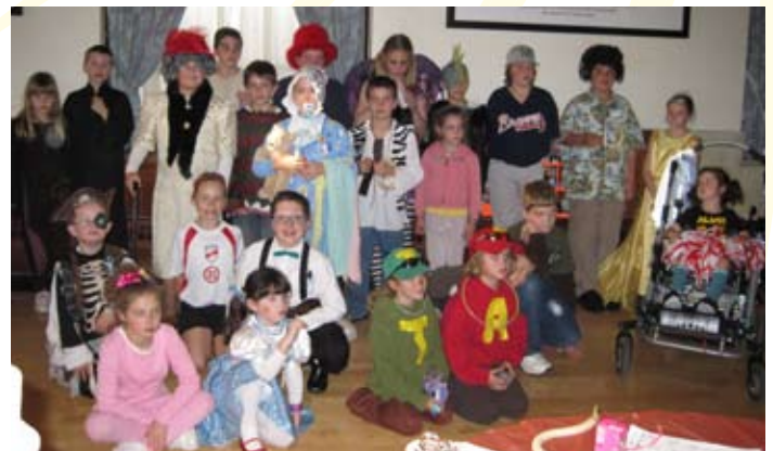
Happy attendees of the Manley Family Halloween Party

shine! The kids helped to set up and get ready and even extended family helped to fundraise for the event. In its second year, the event doubled and raised over $2,000 for Camp Sunshine!