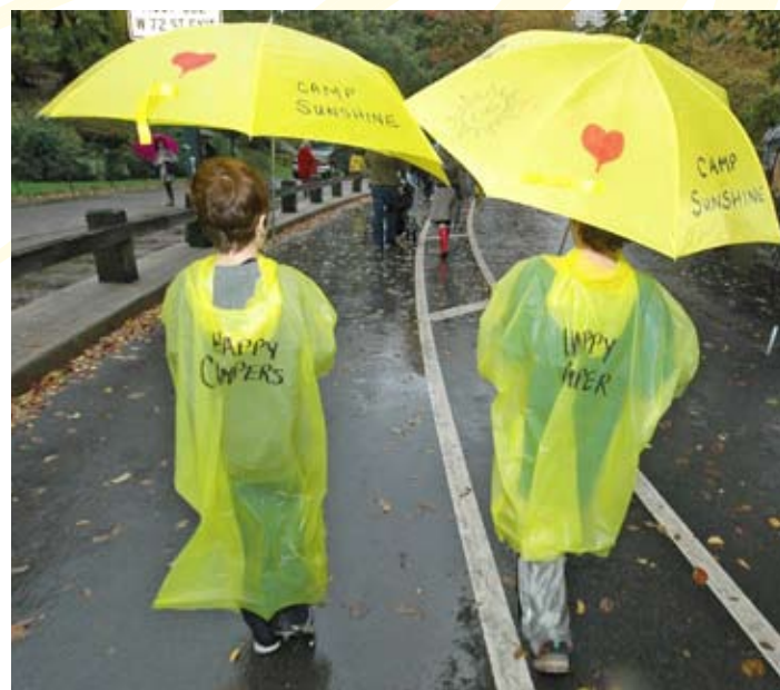
Happy Campers Walking for Camp