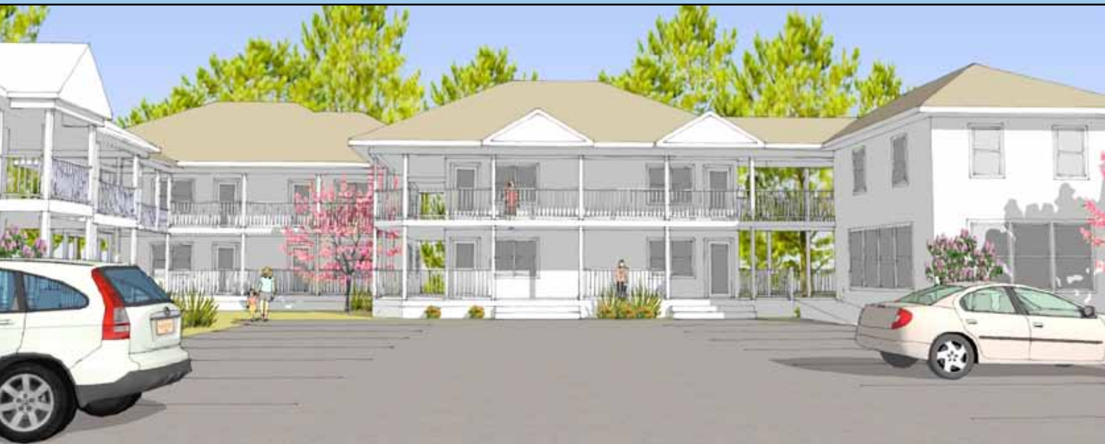
Architect's (Archetype) sketch of the volunteer building expansion.